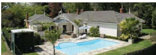
Oaklane Lodge is located at 78A Horrell Road, Morrinsville.

Bring along a picnic, drinks, fold up chairs and your togs for a dip in the pool. No food or alcohol will be provided but there will be plenty of water given away.