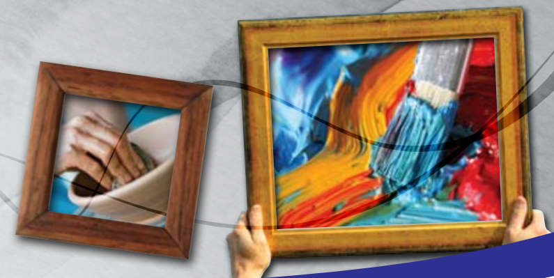
Daffodil Day art by Morrinsville Primary School students.