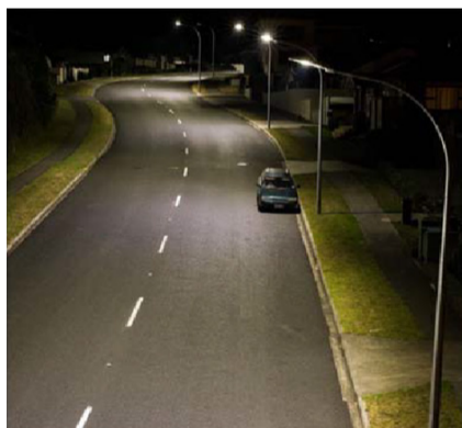
LED street lighting