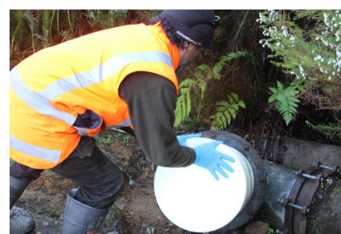
The sponges get fed through the water line