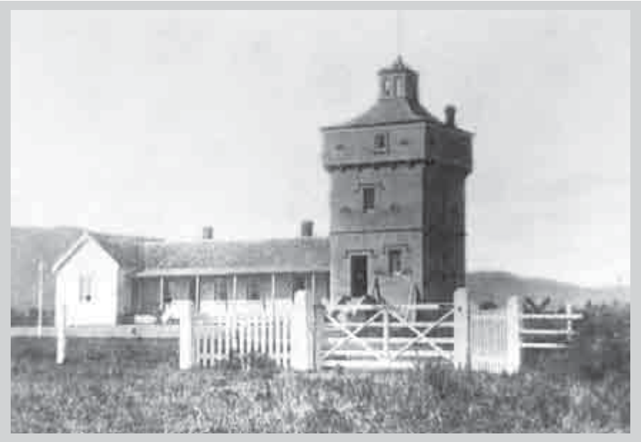
Site 23: Firth Homestead and Tower, 1884.

Public toilets here. For further details about the museum see the brochure available at the museum office or at the Matamata i-SITE in the town of Matamata. (3.9km)