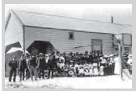
Site 15: Opening of Okauia Creamery, 1909.