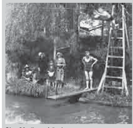
Site 20: Crystal Springs.

swimming pool. In 1979 the name was changed to Crystal Springs Park and Motor Inn. It is now privately owned by an organisation called YWAM (Youth With A Mission) Family Ministries NZ. See information Board at entrance.