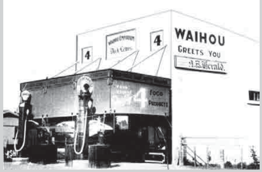
Site 55: Dick Lewis' Emporium.

Historic Places Trust Category II; MPDC Heritage Site.