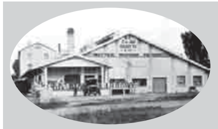
Site 33: Waharoa Butter Factory built 1921.

Today at Kaimai Cheese visitors can view the cheese-making process through huge plate-glass windows in the café while sampling the variety of cheeses made there. These included camembert, creamy blue cheese and creamy brie as well as mature cheddar. For more details see the Information Board.