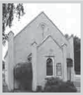
Site 30: St David's Church, Waharoa.

Waharoa Friendship Centre meets there monthly. The 80th Jubilee of St David's was held in October 2005. Annually at Christmas time the church is decorated and opened to the public.