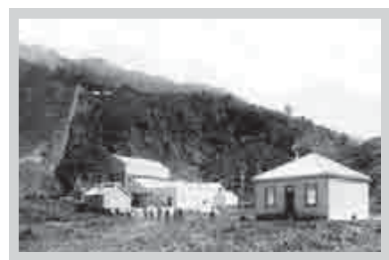
Site 3: Firth and Clarke Battery (centre) at Wairongomai, near the end of Loop Road. Fern Spar Incline at the left.

Along the stream and the bush-clad valley slopes, lies an extensive track network where the remains of tramlines, pack tracks, cart tracks, water races and other relics of gold mining days can still be seen. A series of interpretation panels on the track give a valuable insight into the natural and cultural history of this area. MPDC Heritage Site.