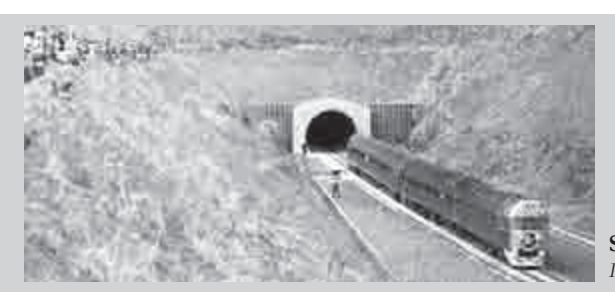
Site 10: Kaimai Tunnel.

A display about the Kaimai Tunnel is on show at the Firth Tower Museum. Continue along Old Te Aroha Road to see the site of the halfway house on the corner of Old Te Aroha Road and Goodwin Road. (3.7km)