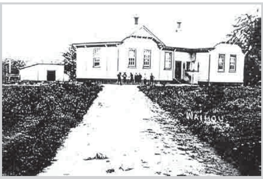
Site 54: Waihoa School.

MPDC Outstanding Trees – 17 English Oaks.