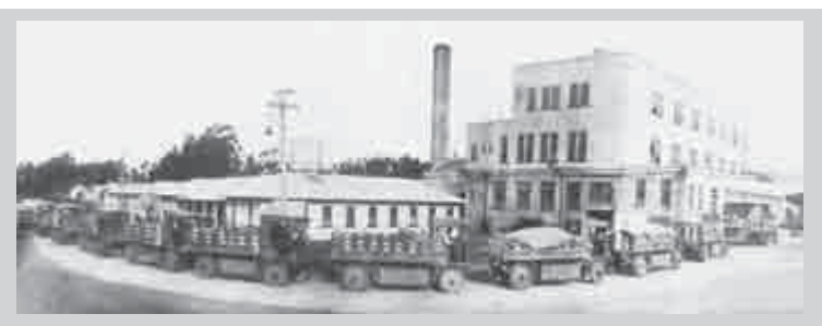
Site 50: Waitoa Milk Powder Factory showing Walker electric trucks bringing milk to the factory, 1924.

The Waitoa factory was the first in New Zealand to be supplied by tankers, which began operating in 1952. In 1981 a modernised powder plant and a new cheddar cheese factory were opened. New Zealand Milk Products, of the Fonterra Group, took over the ownership of the buildings and site in 2001.