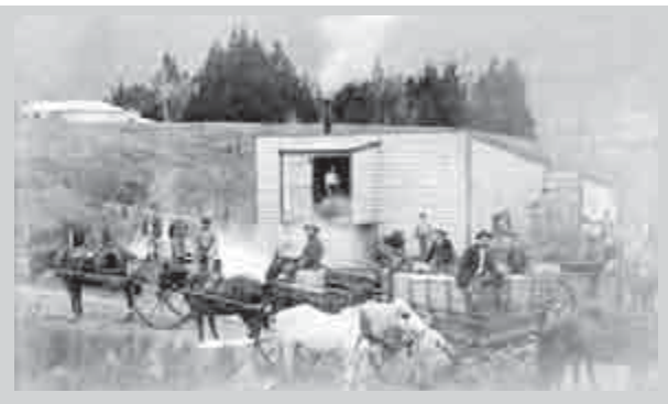
Site 6: Gordon Creamery.

300 gallons of milk per hour. Every morning farmers brought their cans of milk in waggons to be processed. The cream was then sent in a waggon drawn by two horses along Wardville Road to Waharoa railway station, where it was consigned to the butter factory at Ngaruawahia in the Waikato and later to Frankton.