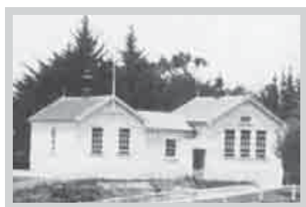
Site 42: The old Walton School.

Okauia (near Matamata) and Wharepaina (south of Rotorua) were transferred to Walton and refurbished there.