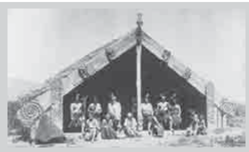
Site 27: Tamihana's Meeting House.

mill stones were brought up the River Waihou and carted to the Waitoa River to be used in the mill. Wheat was grown on the farms, ground at the mill and the flour carted over a road to the Waihou River and sent to the Auckland markets. A large meeting house (Whare Runanga) was built here also. This site is also on the Council protected list.