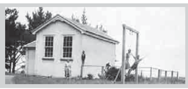
Site 8: Gordon School.

district near Te Poi. When this school closed in 1963, the old Gordon school was used as a hay barn until it was taken to the Firth Tower Museum, Matamata. The new school, left on this site when the school closed at the end of 1973, served as an office for the New Zealand Forest Service (later the Department of Conservation) from 1979, until a year or two later when it moved to an adjacent section. The school building is now used as a Community Hall.