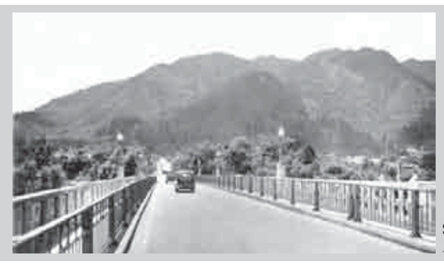
Site 58: Coulter's Bridge.

The Te Aroha Clock Tower can be seen at the end of the street and the television transmitting tower can be seen on the top of Mount Te Aroha.