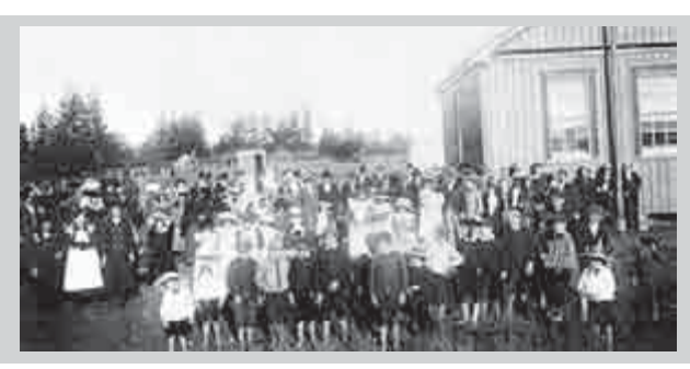
Site 51: Waitoa School official opening, 1904.

rooms on this site in Ngarua Road. In 1968 a fire destroyed the old block and new buildings were erected. In 1997 the Waitoa School Historical Society moved the original 1904 school building on to the present site and restored it for use as a community museum.