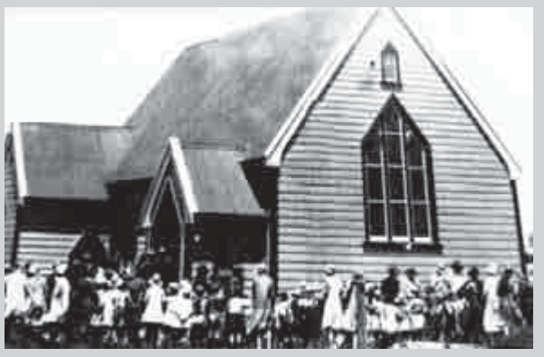
Site 57: Waihou Historical Pioneer Church. The opening by Sir Charles Ferguson.

Historic Places Trust Category II; MPDC Heritage Site. See information board inside the church gates for full details.