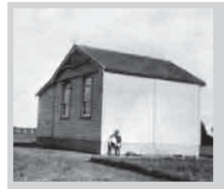
Site 19: Okauia Primary School.

was transferred to Walton School. The Okauia Hall, opened in 1961, was built on the site of the old Okauia School horse paddock.