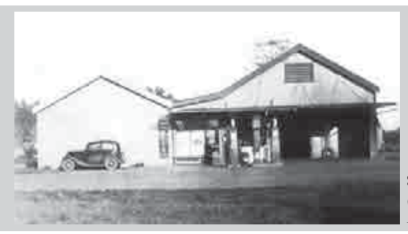
Site 53: Red Star Service Station (Russell's Garage).

Historic Places Trust Category II; MPDC Heritage site