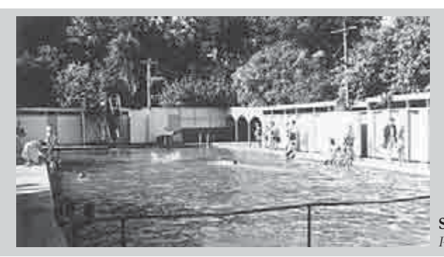
Site 21: Opal Springs.